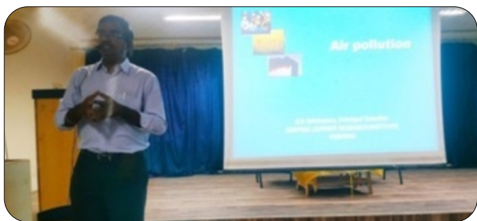
Lecture on 'Air Pollution'

'Computer Aided Design and Analysis of Structures using Finite Element Method Concepts in Structural Engineering' organized by the Dept. of Civil Engg from 17.06.2019 to 22.06.2019 at Eashwari Engg College.