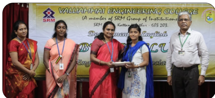
An Oratorical Competition winner awarded prize

The third session of the Oratorical Competition under the auspices of 'Burke Club' was held on 4 th April 2019. The first year students exhibited their oratorical skills and participated enthusiastically. The winners were rewarded with prizes and certificates.