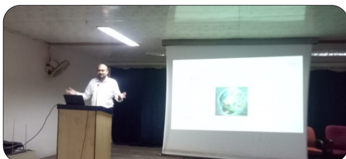
'Motivational Talk' for the second & third year students