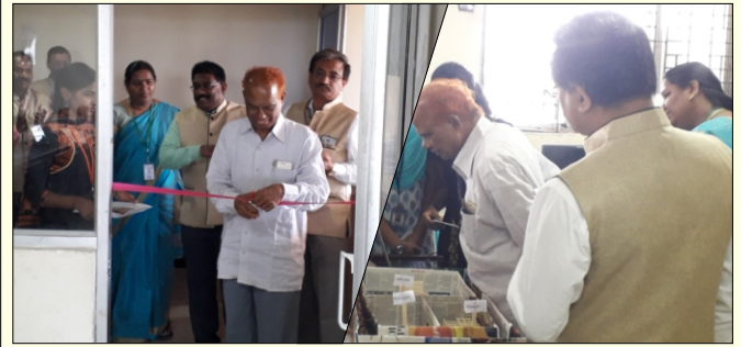
Inauguration of IoT Lab