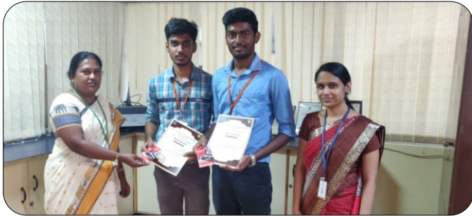
Students receiving 'Students Best Project 2019 award as part of the Project Expo 2019

The 'Students Best Project 2019' awards were distributed to the students on 22.04.2019 as part of the Project Expo 2019.