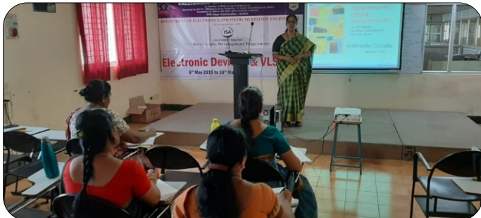
Faculty Development Program on the 'Electron Devices & VLSI'

The Dept. in association with the ISA VMEC Student Charter organized a Faculty Development Program on the 'Electron Devices & VLSI' from 06.05.19 to 10.05.19.