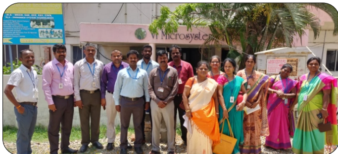
Faculty Industrial Visit to 'Vi Micro Systems Pvt. Ltd', Perungudi, Chennai