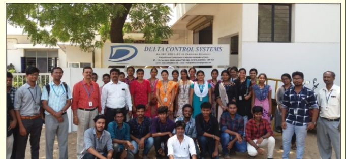
Industrial visit to Delta Control Systems and Chennai Engineers