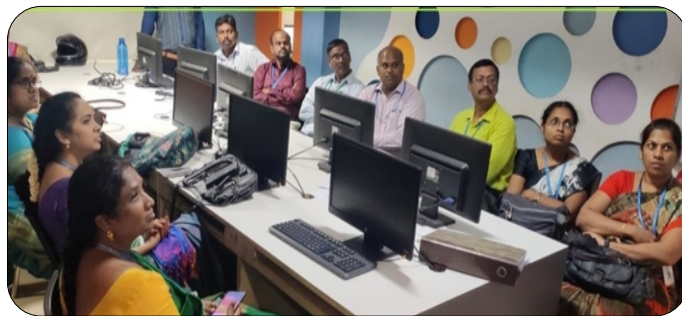
Industrial Visit to the 'Image Creative Education Pvt. Ltd, Chennai'

A one day Industrial Visit to the 'Image Creative Education Pvt. Ltd, Chennai' was organized on 07.06.2019 for the Staff.