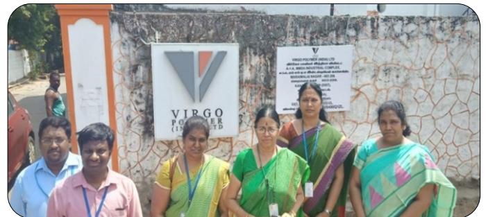
Industrial visit to M/s. Virgo Polymer India Ltd,

An industrial visit to M/s. Virgo Polymer India Ltd, was organized for the Faculty members of the Dept. on 26.04.2019. 6 Faculty members from the Dept. visited the production facility and had the opportunity to understand the manufacturing process and the quality control measures implemented in the organization in a real time environment.