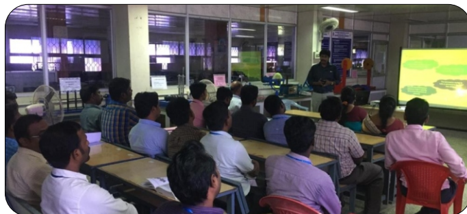
FDP on the 'Fluid Mechanics and Dynamics'