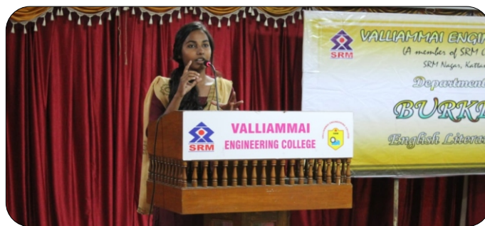
Participant of Oratorical Competition

Linguathon Phase-II, a series of competitions consisting of JAM, Snap Talk and Short Film making and Review, was held on 5 th April 2019. The competitions were conducted for the first year students. Students were provided opportunities to display their photographic skills. The most talented students were given prizes and certificates.