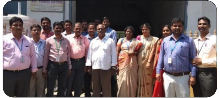
Teaching Staff Industrial Visit to Vimal Nonferrous Casting, Chennai

The Teaching Staff went on an industrial visit to Vimal Nonferrous Casting, Thirumudivakkam, Chennai on 16 th April 2019.