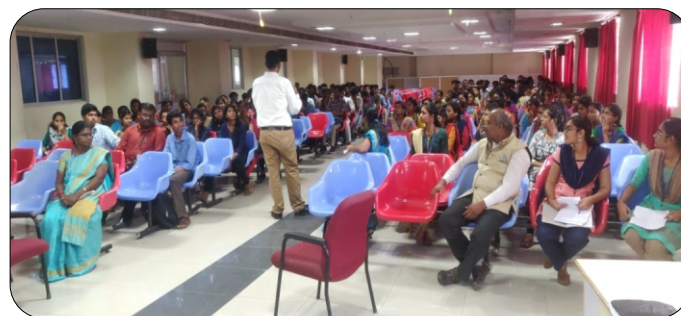
'Motivational Talks' conducted as part of the Bridge Course