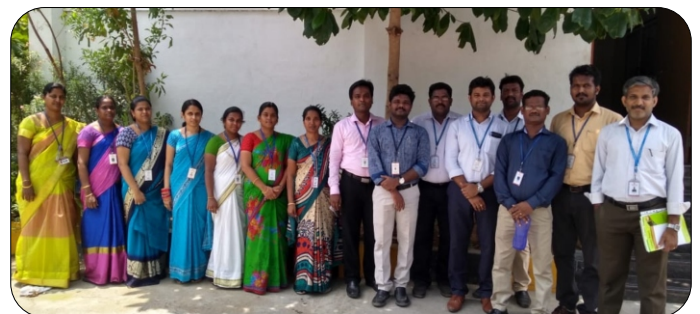
Faculty Industrial visit to 'Green Pearl Electronics Pvt., Ltd'