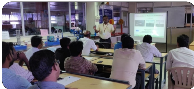
FDP on the 'Fluid Mechanics and Dynamics'