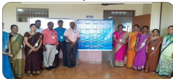
FDP on 'Mathematical Computation in Computer Science'

A five day Faculty Development Programme was conducted on 'Mathematical Computation in Computer Science' from 24 th to 30 th May 2019.