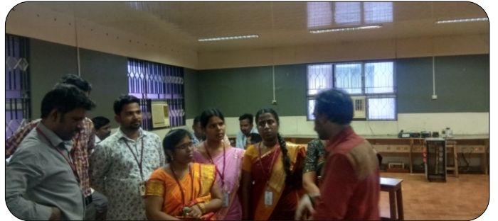
SDP on the 'Erection of Solar Power Plant'