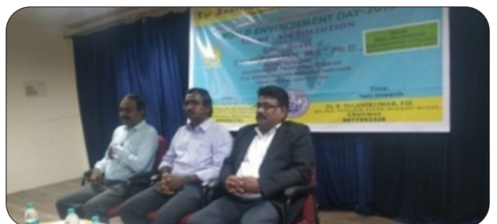
World Environment Day Celebration - 2019