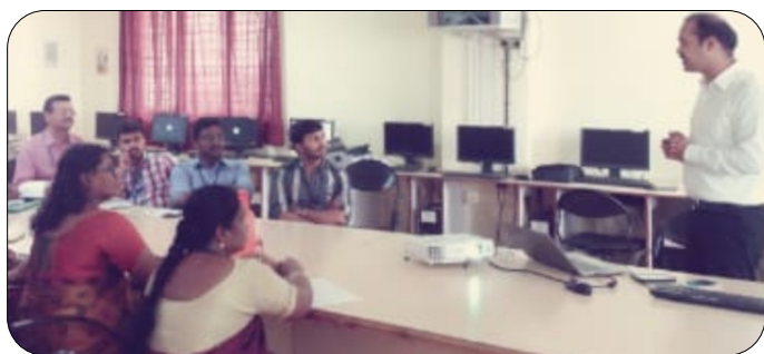
FDP on 'Communication, Network and Security'

A six day FDP on 'Communication, Network and Security' was organized from 28.05.19 to 04.06.19 for the Teaching Staff.