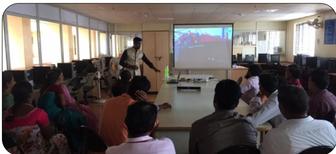
SDP on the 'Plastic Waste Pollution, a Powerful Destructor into Future Resource'

The Dept. in association with the ISA VMEC Student Charter organized a Staff Development Programme on the 'Plastic Waste Pollution, a Powerful Destructor into Future Resource' on 08.05.19.