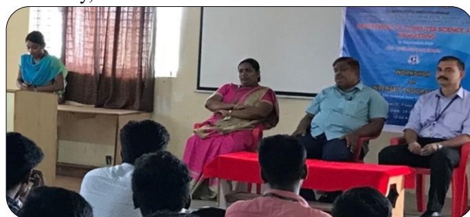
Workshop on 'Internet Programming'