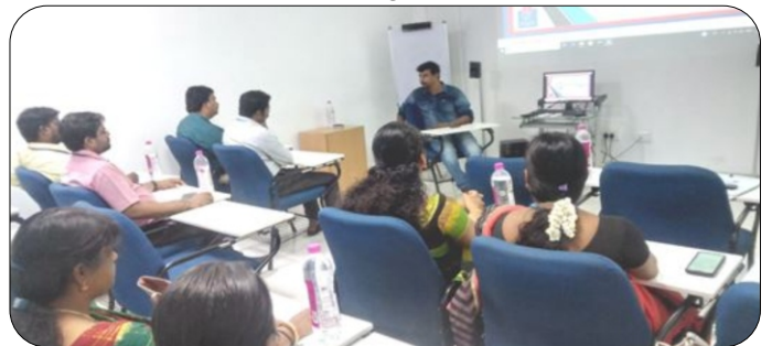
FDP on 'Electrical Machines-I'