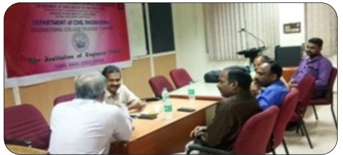
Quarterly meeting of IE(I) Kanchipuram Local Chapter