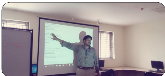
SDP on the 'Networking and Data Security'