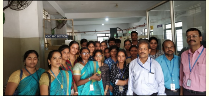
IoT Boot Camp - 2K19