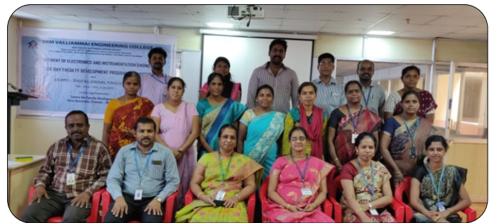
SDP on the 'Digital Signal Processing'

Program sponsored by the Anna University on the 'Digital Signal Processing' from 10.06.19 to 15.06.19.