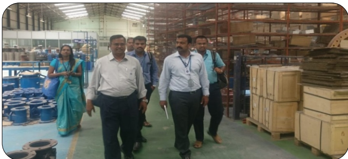
Industrial visit to M/s. RLT Instrumentation Pvt. Ltd

An industrial visit to M/s. RLT Instrumentation Pvt. Ltd was organized for the Faculty members of the department on 12.06.2019. 6 Faculty members from the department visited the production facility at Aathur Village; Chengalpattu Dist. The Faculty members had the opportunity to understand the manufacturing process and the quality control measures implemented in the organization in a real time environment.