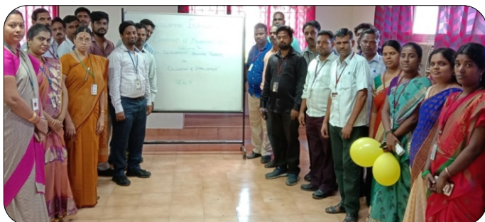
Skill Development Training Programme for the Non Teaching staff members on the 'Delegation and Empowerment'