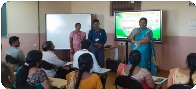
Staff Development Training Programme on 'Adobe InDesign'