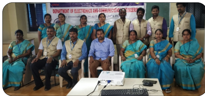
Faculty Development Programme on the 'Digital and RF Communication'