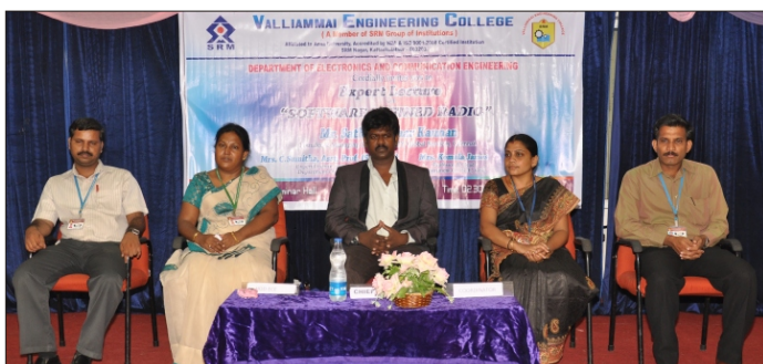
On the occasion of Expert Lecture on the 'Software Defined Radio'