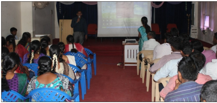
On the occasion of the FDP on the "Visual Modelling Using UML with IBM Rational Software Architect (RSA)"