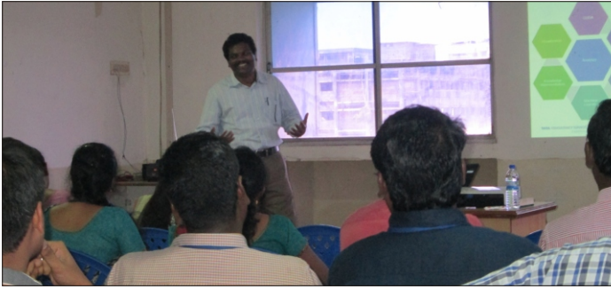
A Faculty Development Programme on "BIG DATA" by TCS