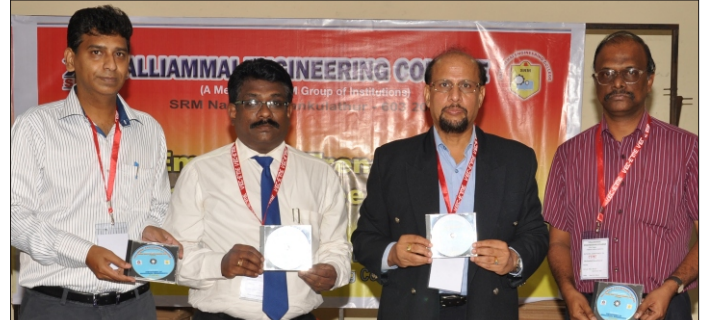
On the occasion of the release of CD on the National Conference on 'The Emerging Trends in Mechanical Engineering'