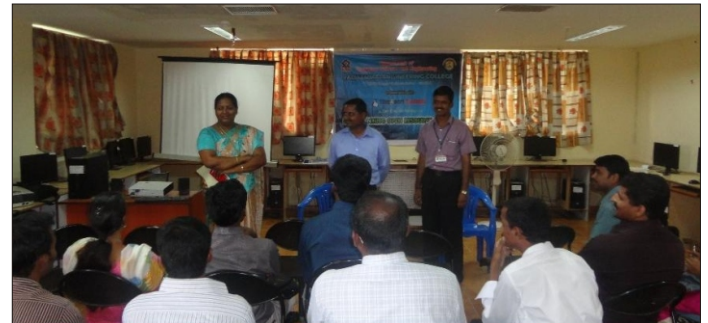
On the occasion of LINUX Workshop