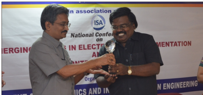
Principal felicitates the Chief Guest on the occasion of the National Conference on EtEIC '14