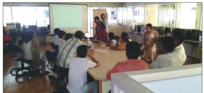
Workshop on Virtual Instrumentation