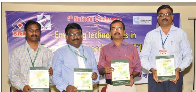
Souvenir Release in the National conference on NCEEE '14