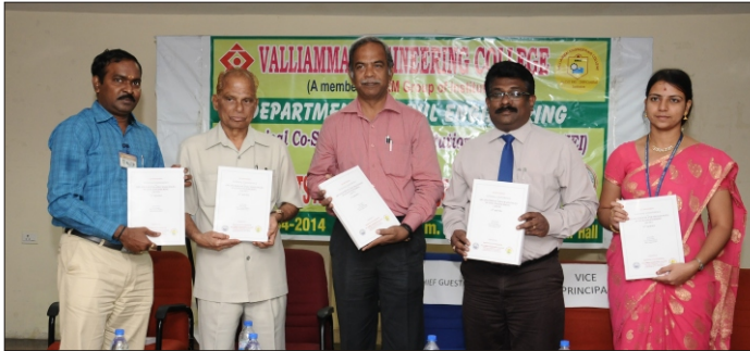
From left HOD Civil, Pro VC, SRM University & Director, Valliammai Engg. College, Chief Guest, Vice Principal & Conference Co-Convenor on the occasion of Release of Souvenir in the National Conference ACCE