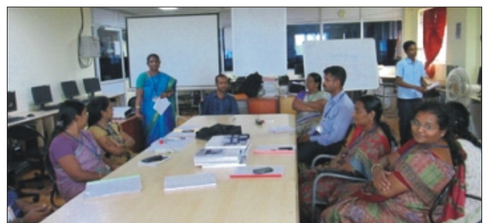
On the one day Training Programme on “iLearning Course”