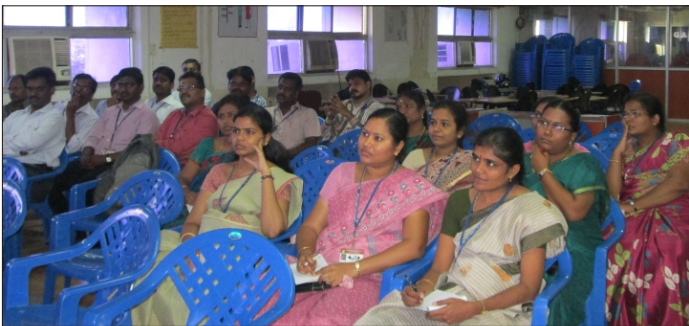
Faculties from various departments on the Faculty Development Programme on "BIG DATA"