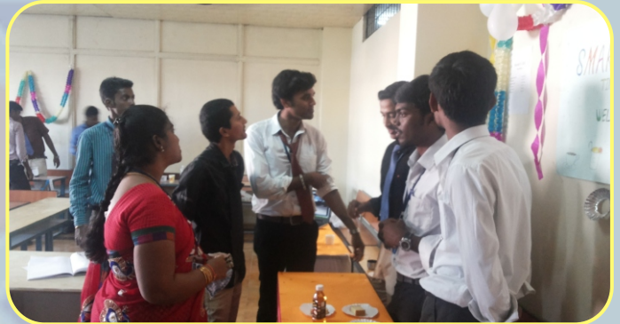
The exercise of stall building with artificial & real products

Management Studies, Sri Krishna Engineering College, Chennai, delivered a lecture on the "Training for knowledge workers".