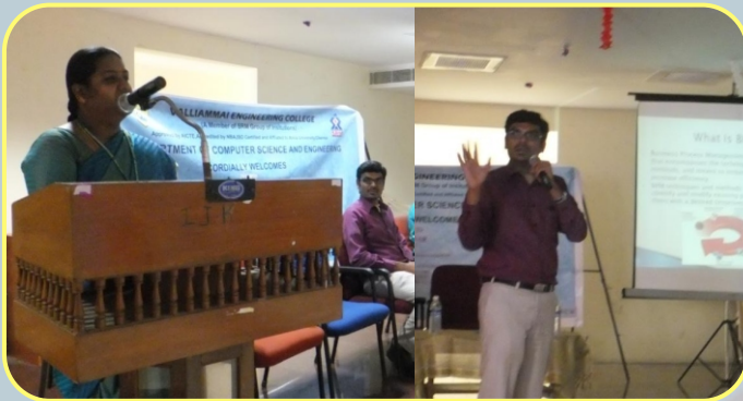
On the occasion of Business Process Management