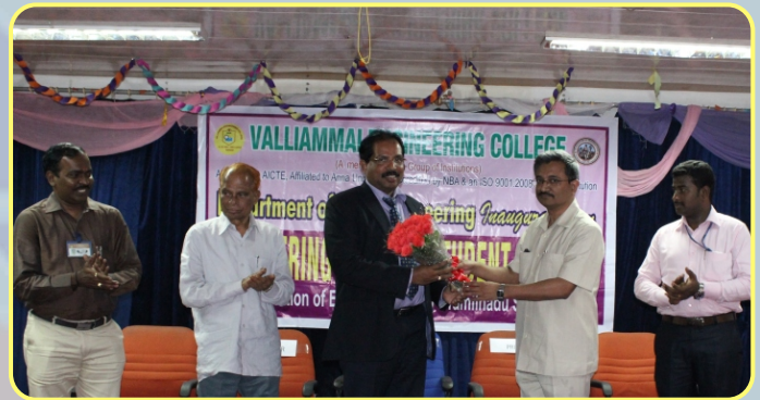
Inauguration of “Engineering College Student Chapter”