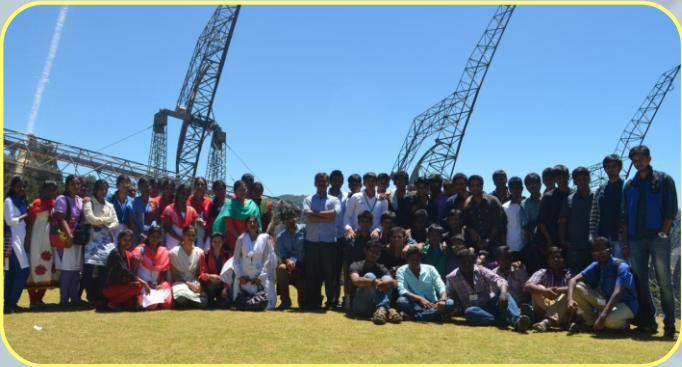
Industrial Visit to Radio Astronomy Centre