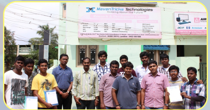
Staff and students in an Industrial visit to "Maven Tricks Technologies"

The Students of III year started a Non Governmental Organization called "JANANAM" on Feb. 13 to educate the needy for their studies and initiated to start a website Gogroc.com for online shopping.