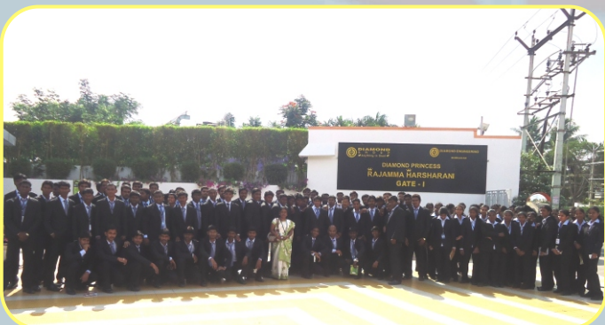
An Industrial Visit to Diamond Engineering (Chennai) Pvt. Ltd. for I year MBA students