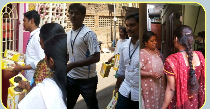
On the occasion of "World Sparrows Day"

On this observance, the staff and students of MBA department formed a special group "NEST" and conducted public awareness campaign in and around KALADIPET, Tiruvotriyur, Chennai on Saturday 29.03.2014. A sparrow nest box was provided to all houses.