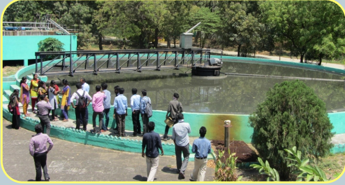
Industrial Visit to "Sewage Water Treatment Plant" at Nesappakkam

Technology, Kundrathur on 11th February, 2014 and were awarded the Second Prize.