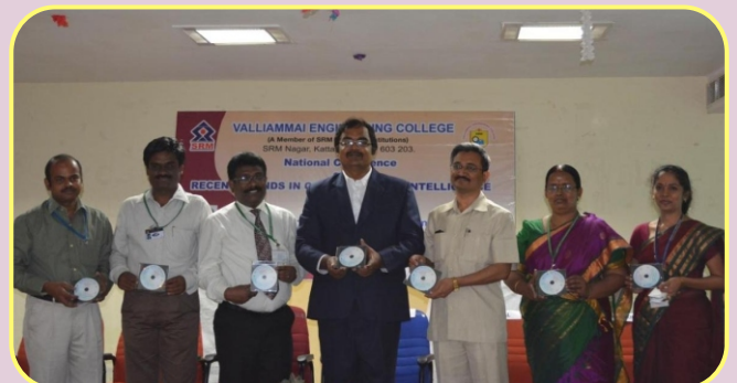
Dignitaries releasing CD in the National Conference 'The Recent Trends in Computational Intelligence 2014' (NCRTCI '14)

The Chief Guest in his key note address pointed out the importance of the various intelligences like Human Intelligence, Animal intelligence and Computational intelligence through a story. This