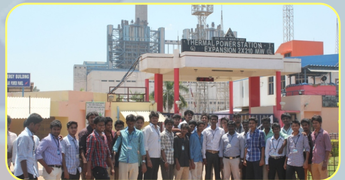
An Industrial Visit to Neyveli Lignite Corporation