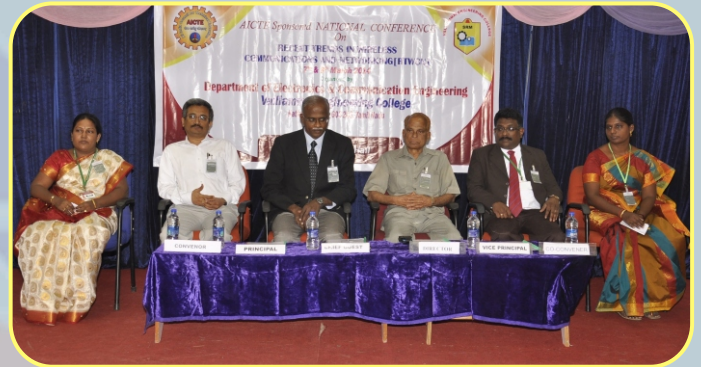
On the occasion of National Conference 'Recent Trends in Wireless Communications and Networking'