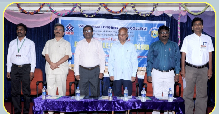
Inauguration of Renewable Energy Club