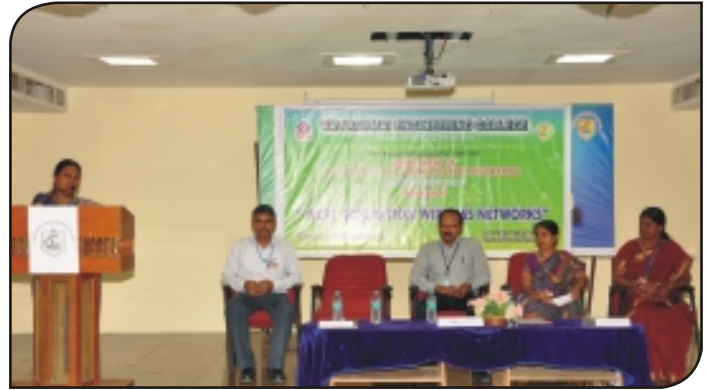
Next Generation Wireless Networks