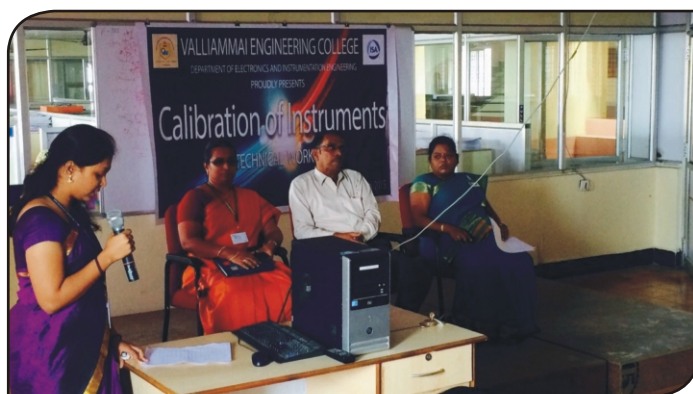
The Department in association with ISA VMEC Student Charter organized a workshop on 'Calibration of Instruments'