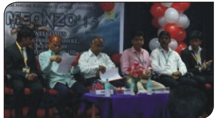
The Director, VEC, The Chief Guest and HOD in the Symposium Meqzn015

The Mechanical Engineering Department conducted the following.