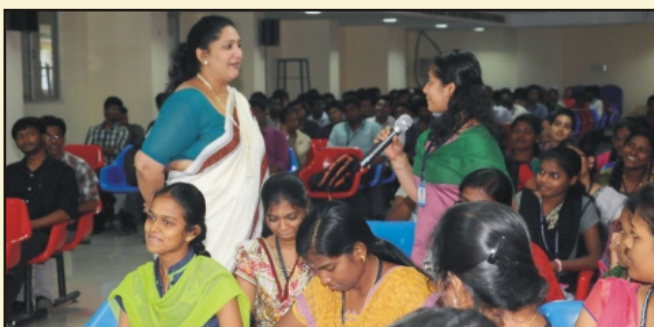
One among the Dignitary of National Seminar MetiHer '15 explaining students' doubt

Department of Placement and Career Guidance organized the first National Seminar METIHER'15 on 20th March, 2015. A total number of 250 participants from different colleges attended, the program. The resource persons were reputed HRs from several giant companies.