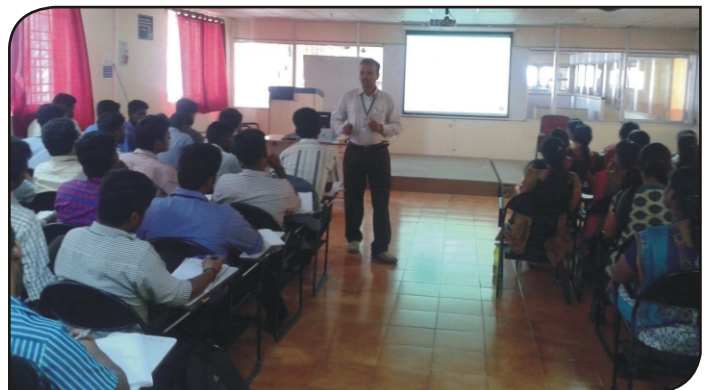
The Department in association with ISA VMEC student charter organized a Guest Lecture on 'Digital Signal Processing'