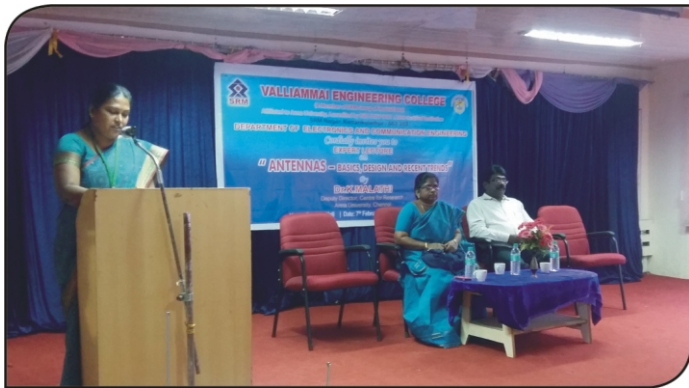
On the occasion of an Expert Lecture on Antennas-Basic Design and Recent Trends