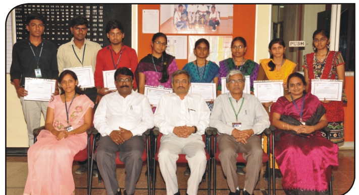
Essay Competition Winners