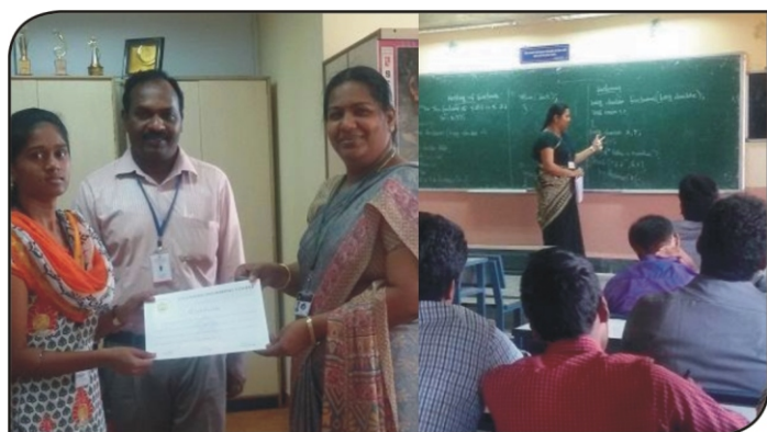
Value Added Course conducted by the Dept. of CSE