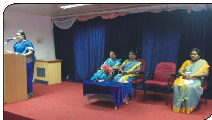
HOD, IT Addressing the Gathering in a Seminar

A two day Project Exhibition 'PROJECTEXPO 2K15' was organized with the theme 'To the Students For the Students by the Students' from 30.03.2015 and 31.03.2015.