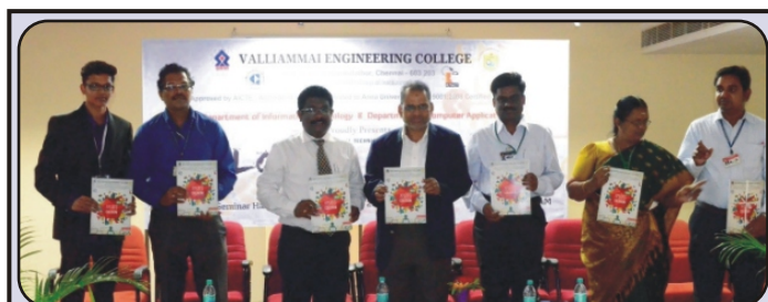
The Dignitaries of the Symposium

A National Level Technical Symposium XploITs2K15 & Colosium2K15 was jointly organized by the Department of Information Technology & Department of Computer Applications on 28.02.2015.