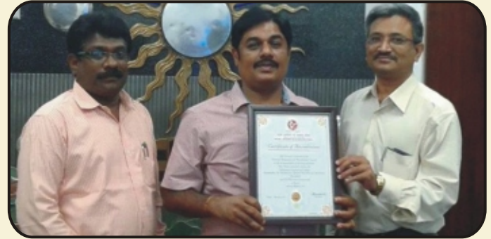
Hon'ble Chairman with NAAC Certificate