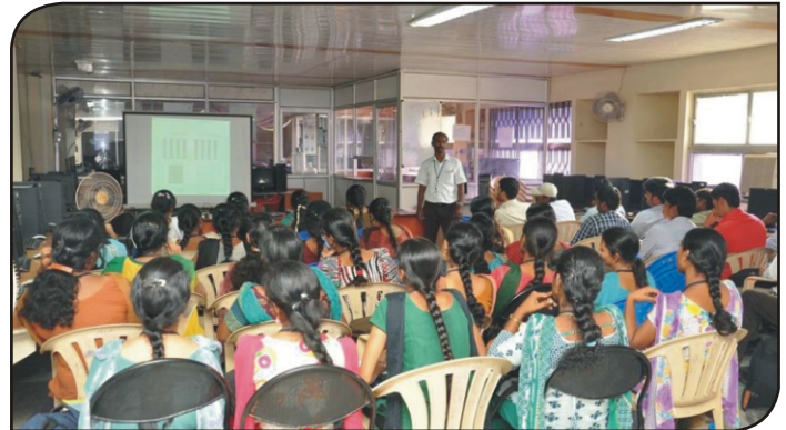
Value Added Course on Image Processing