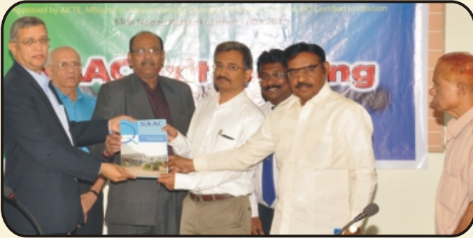
Hon'ble Founder Chairman receives the NAAC Assessment Report from the Peer Team