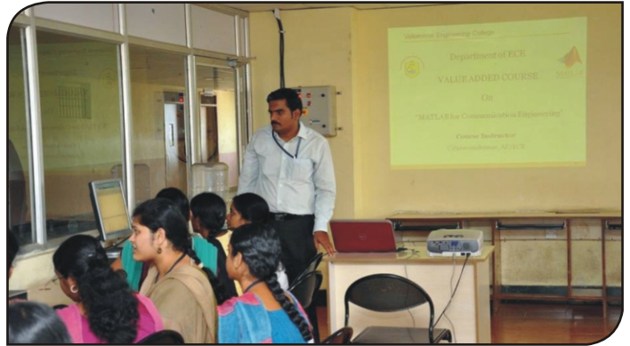
Value Added Courses on MATLAB for Communications

He presented the session on "Wireless Sensor Network and its Advancements".