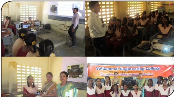
Awareness training programme on Usage of Laptop Computers

A training program was organized on the 'Usage of Laptop Computers' for the benefit of Elementary School students of Government Girls' Higher Secondary School, Guduvanchery on 08.04.15. The Program was intended for creating an awareness among the students on the use of laptops. A Quiz competition was also conducted and the winners were given prizes.