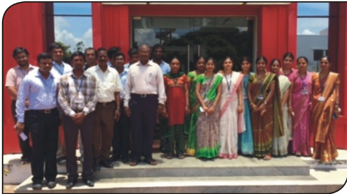
On the occasion of Staff Industrial Visit to Ambattur

10 Staff of our Dept. visited Dr.Ambedkar National Productivity Council New Delhi's Chennai Chapter at Ambattur on 21/04/15. The Chapter deals with the Energy Management Systems which was very useful to the visitors.