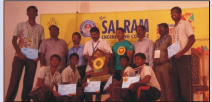
The Winners - TIES 2015

Our College Ball Badminton Team won First Place in Tamil Nadu Inter Engineering Sports 2015 organised by Sri Sai Ram Engineering College on 9 th February 2015.