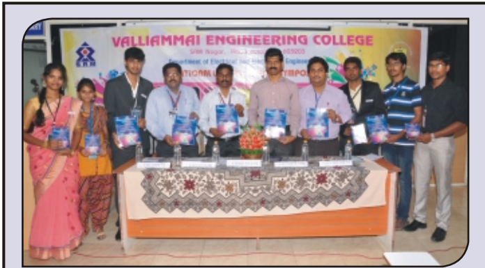
EMERGE'15 - Technical Symposium Souvenir Release