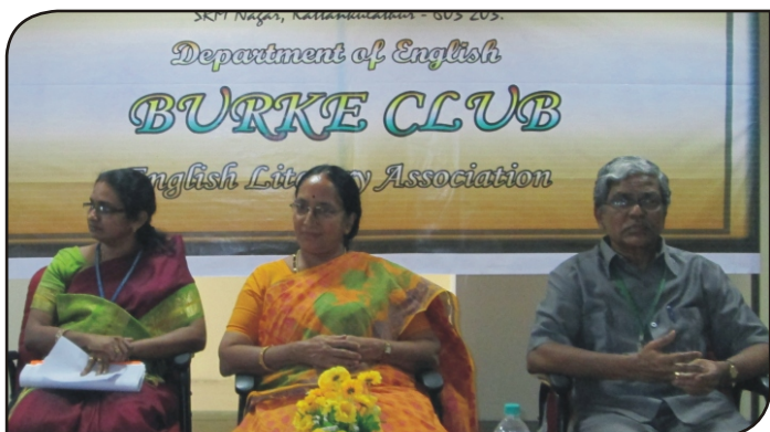
On the Inauguration of Burke Club