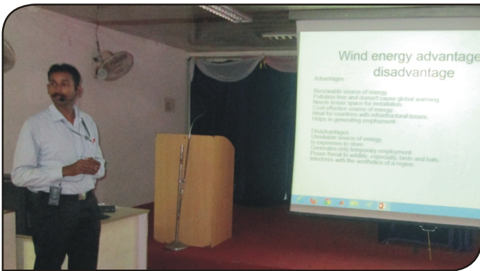
On a one day Guest Lecture in association with Renewable Energy Club