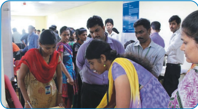
"Mini Project Expo 2k16"

A two day Faculty Development Program on the 'Grid and Cloud Computing' was organized on 30 th June and 1 st July 2016 and IT Staff members were the Resource Persons.