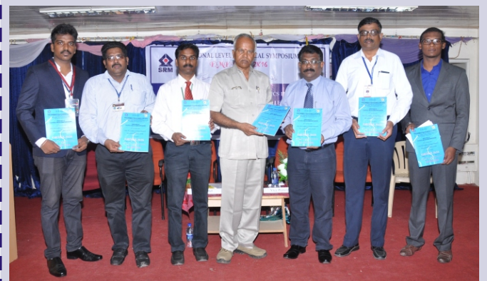
Release of souvenir of the National Level Technical Symposium EMERGE 2k16

Department of Electrical and Electronics Engineering in association with IEEE Valliammai Student branch and Renewable Energy Club conducted a National Level Technical Symposium EMERGE 2k16 on 13 th August 2016.