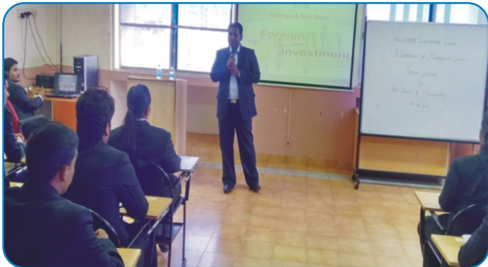
Guest Lecture on the 'FDI Issues and Challenges'