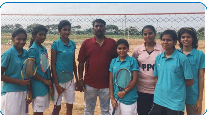
College Ball Badminton Team (Women) won First Place in Anna University Zone IV Ball Badminton Tournament

Our College Cricket Team won the First Place in Anna University Zone IV Tournament conducted by