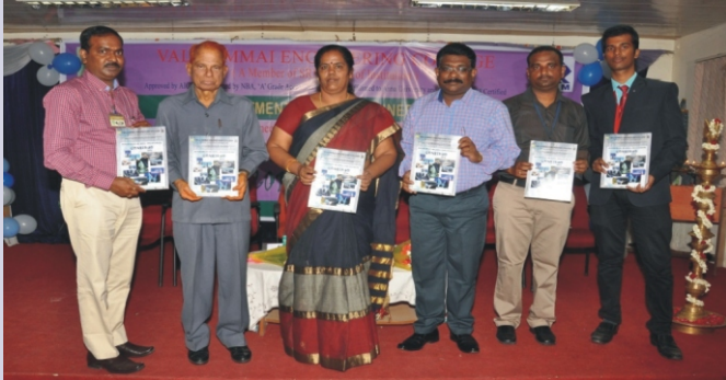
Release of Souvenir by the delegates on the occasion of National Level Technical Symposium 'Construo '16'