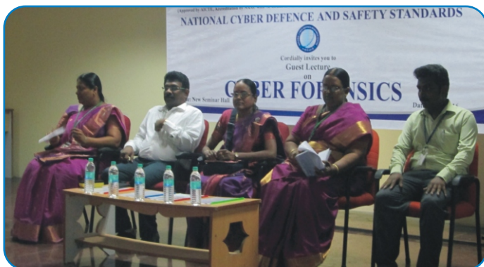
Seminar on the 'Cyber Forensics'

An Industrial Visit at 'BSNL - DTTC, Chennai' was organized on 26 th September 2016.