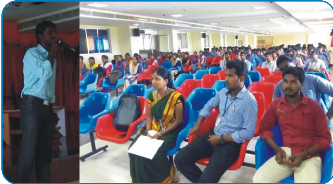
Guest Lecture on the 'Advanced Linear Devices and its applications in industries'