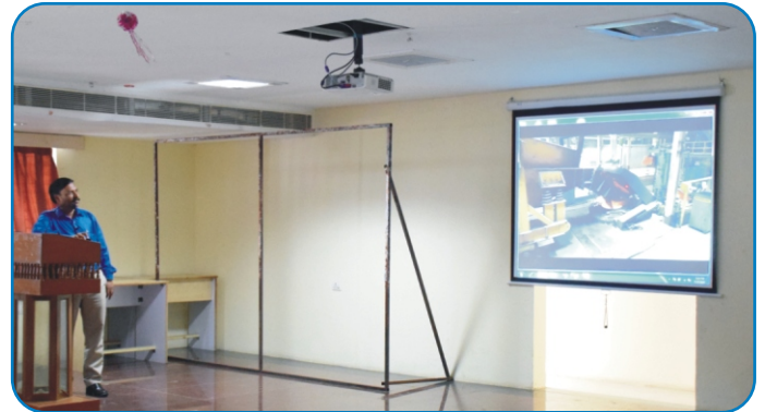
Guest Lecture on the 'Advanced Casting Techniques'