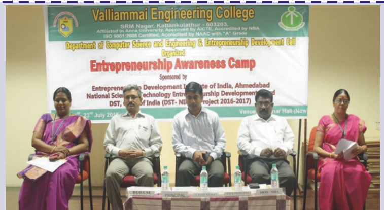
Dept. of CSE and Entrepreneurship Development Cell organized three days Entrepreneurship Awareness Camp on 21, 22 & 23.07.2016