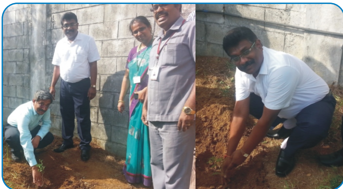
Saplings planted by the Principal and the Vice Principal during the event ORKESTRIM 2k16 on 20.08.06.