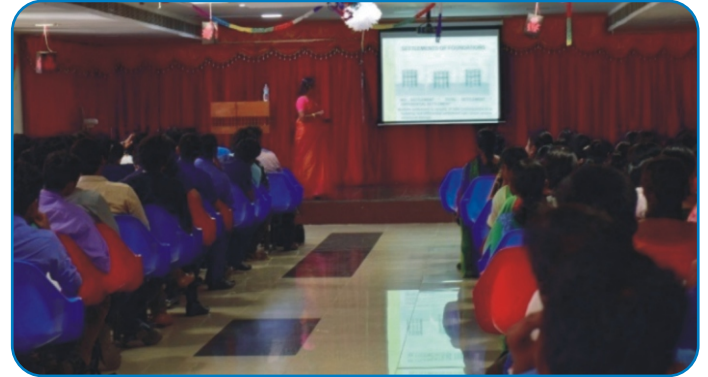
Guest Lecture on 'Foundation Failure'