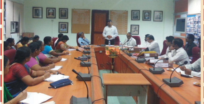
ISO External Audit team visit on 17.08.2016