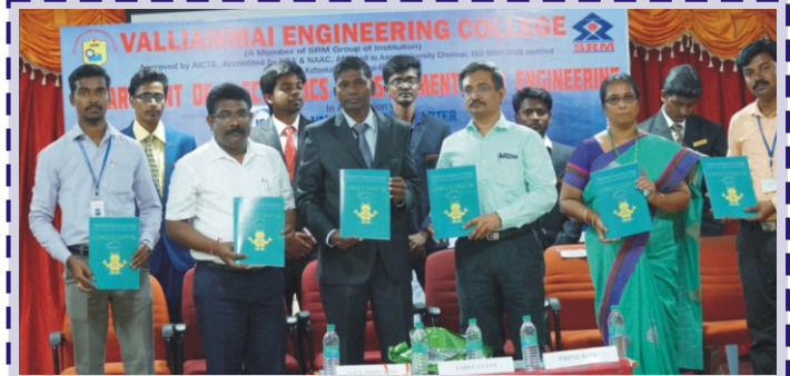
Release of souvenir of the National Level Technical Symposium ORKESTRIM 2k16

The Dept. of Electronics & Instrumentation Engineering in association with ISA VMEC Students' Charter conducted the 6th National Level Technical Symposium ORKESTRIM 2K16 on 20 th August 2016 focusing on the theme 'Improving Agriculture by Empowering Instrumentation'. About 142 Students from various reputed colleges of India and 32 students from Valliammai Engineering College participated. 32 students presented papers on the latest technological inventions and the promising seeds for the future electronics.