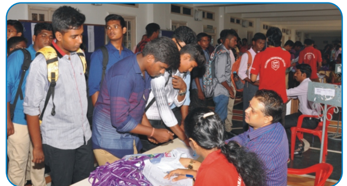
NSS Volunteers guiding First Year UG students in the Inaugural Function

For the Inaugural Function for First Year UG Students, the NSS unit guided the freshers and their parents in the Auditorium. The volunteers also distributed the snacks and beverages to the Guests.