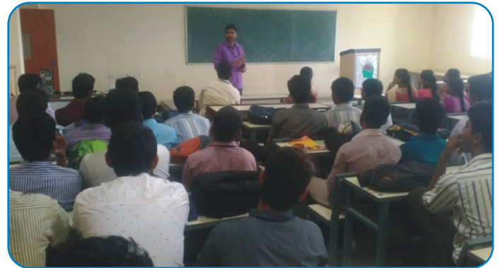
Seminar on 'Opportunities and Challenges of an Instrumentation Engineer'