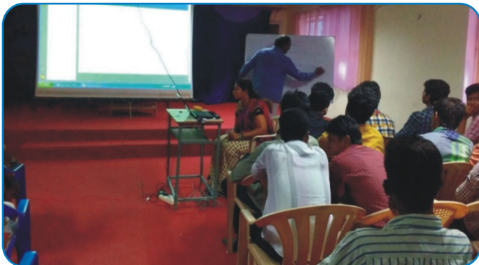
Guest Lecture on the 'Fourier Transforms and its Applications'

The Mathematics Association 'Euler.Com' organized a Guest Lecture on the 'Fourier Transforms and its Applications' on 17 th August 2016. The third semester