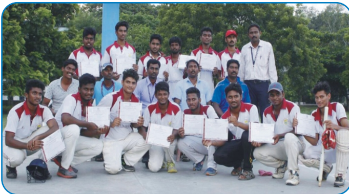
Our College Cricket Team won First Place in Anna University Zone IV Tournament