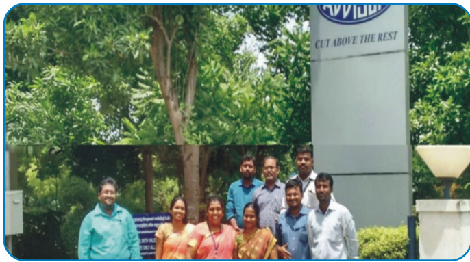
Industrial Visit to Addison & Co Ltd

The Dept. of Management Studies in association with the Confederation of Indian Industries, Chennai conducted Webinar on Career Guidance for the final year Mechanical Engineering students on 19 th July 2016.