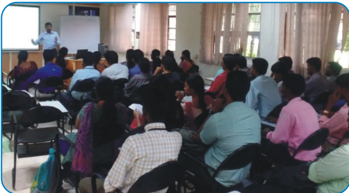
Seminar on the 'Electromagnetic Transients'

IEEE technical talk was conducted by the Dept of Electrical and Electronics Engineering in association with IEEE Technical Club. Our Staff presented technical talks on different topics. The details are as follows.