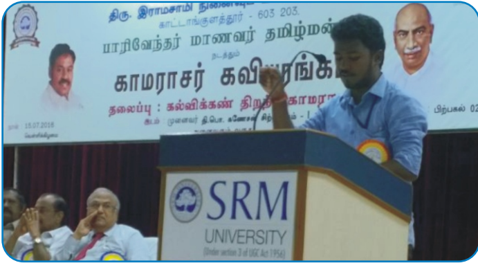
'Kalvikann Thirantha Kamarajar' - Poetry Competition