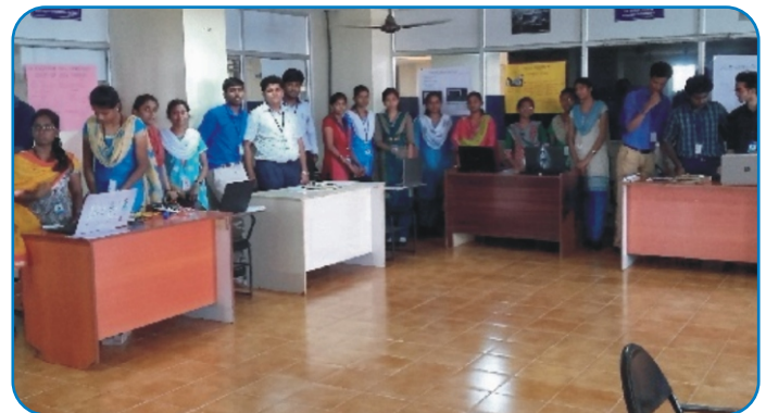
Mini Project Expo-2k16