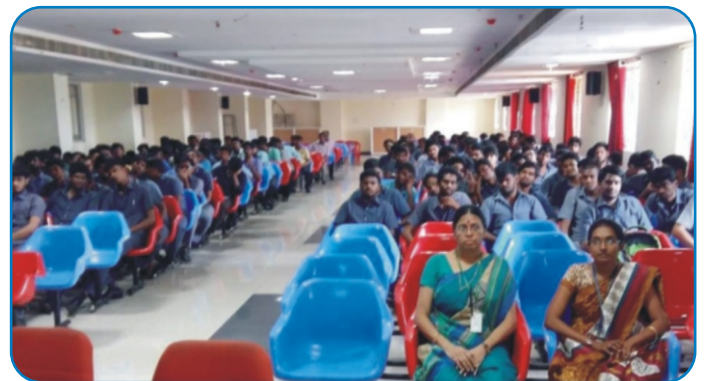
Webinar on Career Guidance for the final year Mechanical Engineering students

As a part of the Institutional Social Responsibility, the Dept. of Management Studies conducted a one day program on 'Career Guidance and Career Options' for the 12 th Standard students at Guduvanchery Government Girls' Higher Secondary School on