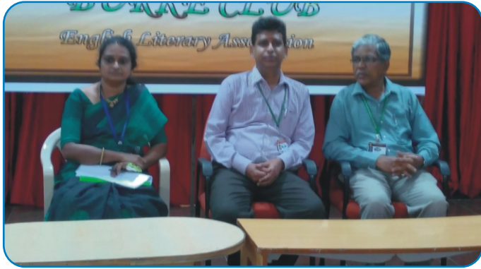
Burke Club oratorical competition