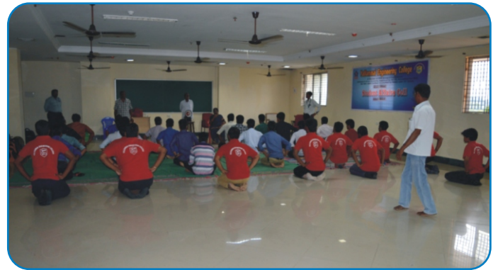
Practising Yoga at our campus