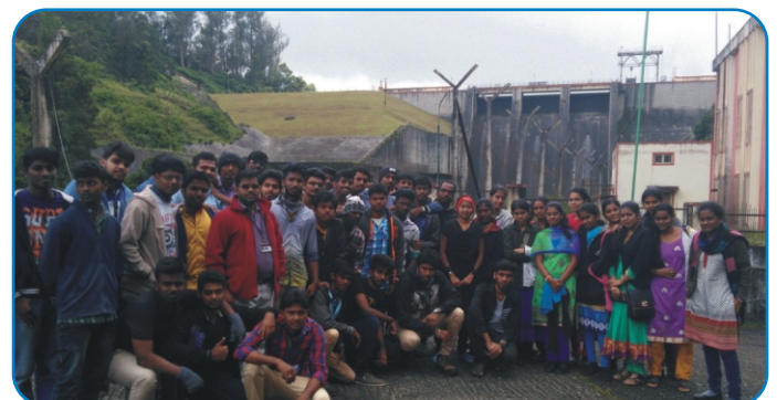
Students on an Industrial Visit to Pykara Hydro Power Plant

A one day seminar on the 'Electromagnetic Transients' was conducted on 26 th September 2016. Mr.V.P.Boopathy, M.E., (Ph.D), EMTP Supporting Engineer Power Sys Solutions was the Resource Person.