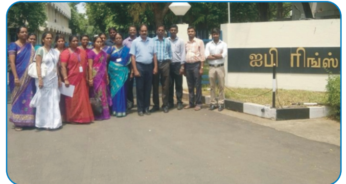
An Industrial Visit to IP Rings Ltd., Maraimalainagar