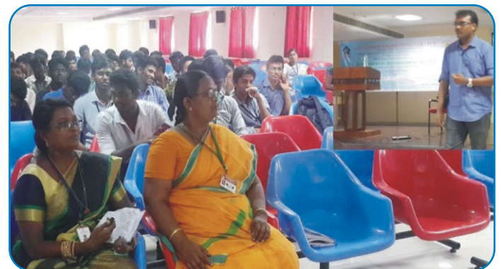
Guest Lecture on the 'Issues in Network Security'