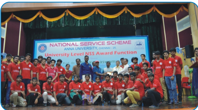
Our College received the Best NSS Unit and Best Programme Officer awards