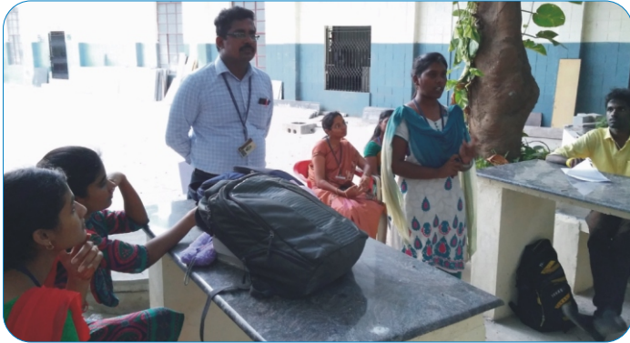
Speech Competition, Poetry Competition, Debate Competition on Thursday Tamil Activities