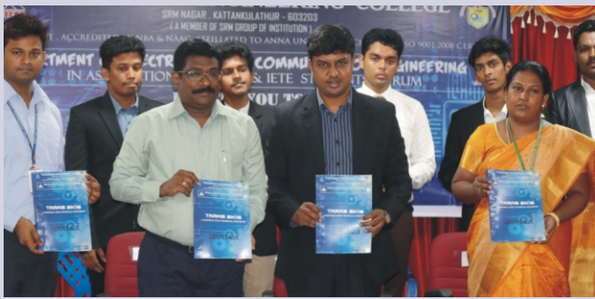
Release of souvenir of the National Level Technical Symposium TARAS '16