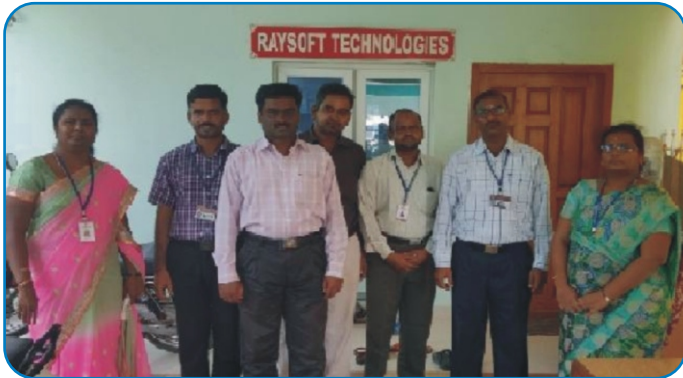
Industrial Visit to Raysoft Technologies

The Dept of Computer Applications has been nominated as the 'Institute of the year Chennai' for the MCA College Category from the Higher Education Review Magazine, Bangalore.