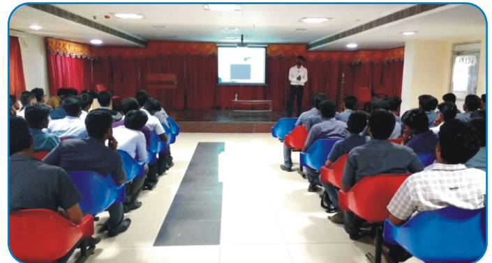
Guest Lecture on the 'Automotive Component Design'