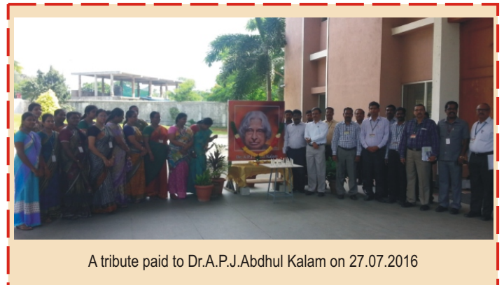
A tribute paid to Dr.A.P.J.Abdul Kalam on 27.07.2016