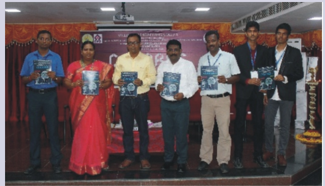
Release of souvenir of the National Level Technical Symposium Cyborgs 2k16

Mini project Expo-2k16 was organized by the Dept of Computer Science and Engineering, in association with the CSI Student Branch on 22-08-16. Various projects like Mobile applications, hacking, web development, Vanet and security applications, etc., were demonstrated. Based on the performance, best 3 projects were selected, out of 27 projects.