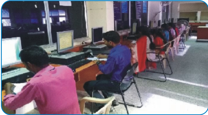
Students of VAC on Android OS development

Institute of Tecnology from 26.07.2016 to 30.07.2016 organized by the ICTACT.