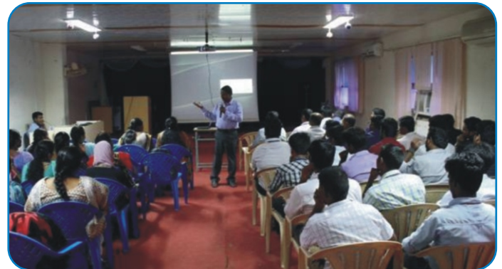
Guest Lecture on 'The Security in Open Source Software'

The Faculty members of the Dept of Computer Applications went on a one day Industrial Visit to Raysoft Technologies, Chennai on 16.07.2016.