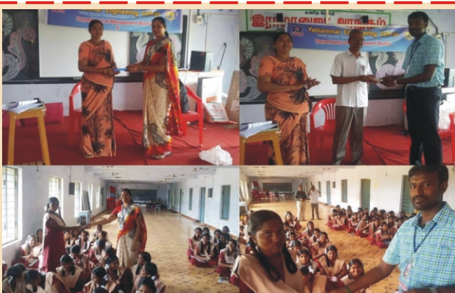
As a part of Institutional Social Responsibility (ISR) - MBA Department conducted a programme on 'Career Guidance and Career Options' at Guduvanchery Govt. Girls HSS on 19.7.2016