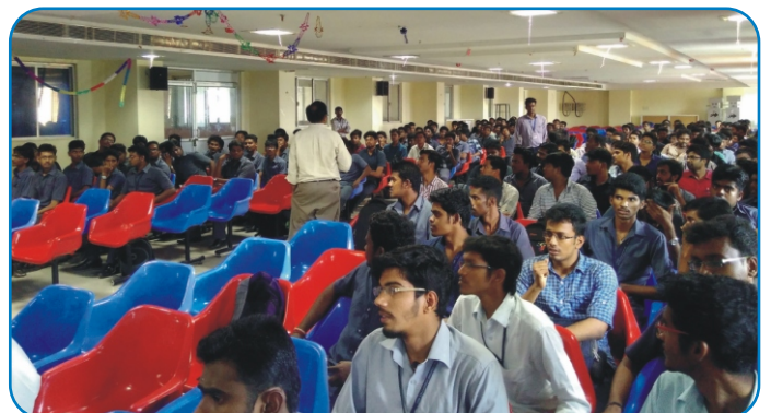
SAE Workshop for the third & final year students