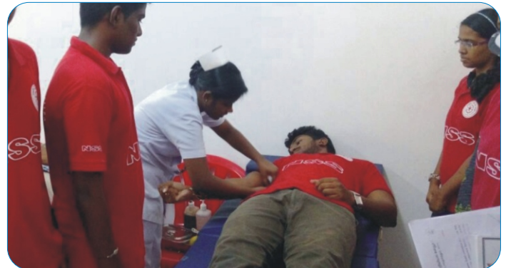
'Blood Donation' on Founder Chairman's Birthday