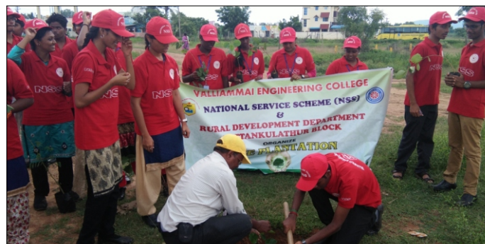
Tree Plantation at Kayarambedu Village