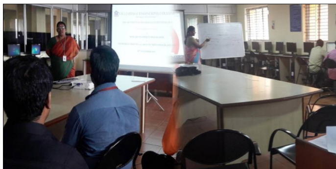
SDP on the 'Introduction to e-Lab in Python Programming'

A one day SDP on the 'Introduction to e-Lab in Python Programming' was organized on November 6 th 2017 for the Non-Teaching Staff and the sessions were handled by our Dept Staff.