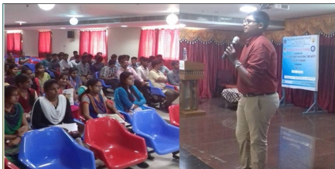
Seminar on the 'Distributed Processing and Networks'