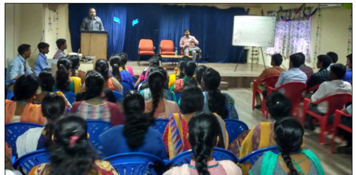
Guest Lecture on the 'Social Entrepreneurship & Management Skills'