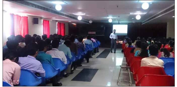
Workshop on 'Enriching and Extending students' learning experiences through reading and writing across the curriculum'