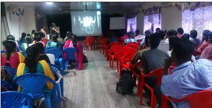
Linguathon competitions - Utopia, Turn a Coat and Adzap

Linguathon Phase I, a series of competitions comprising Utopia, Turn a Coat and Adzap, was organized on 16 th Oct 2017. The students participated actively with great enthusiasm.