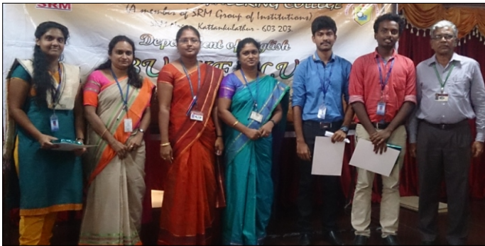
Oratorical Competition under the auspices of 'Burke Club'

The second and third sessions of the Oratorical Competition under the auspices of 'Burke Club' were held on 12 th Oct & 9 th Nov 2017. The winners were rewarded with prizes and certificates.