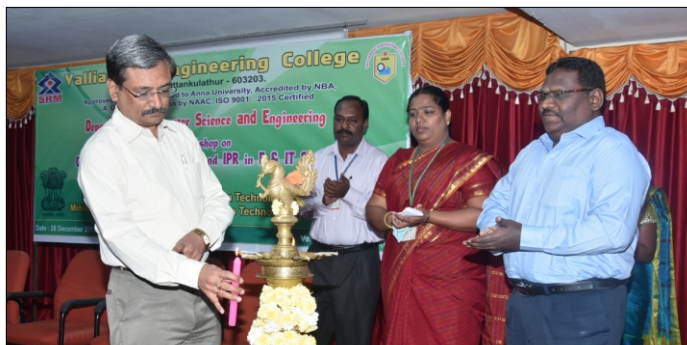
National Workshop on 'Guidelines for Patent Drafting and IPR in E & IT Sector'