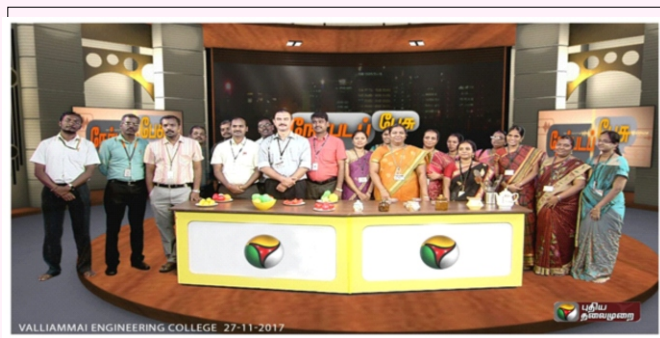
VALLIAMMAI ENGINEERING COLLEGE 27-11-2017