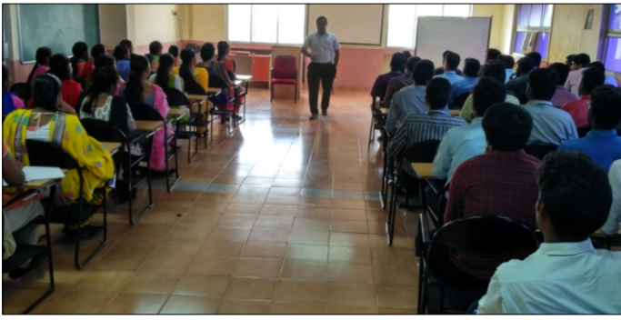
Guest Lecture on the 'Challenges Faced by Fresh Management Graduates on Joining Corporate Sector'

An industrial visit to RLT Instrumentation Pvt. Ltd., Chennai was arranged for the Faculty members of the Dept. of Management Studies on 17.11.2017. The Staff had an opportunity to understand the nuances of the component manufacturing in sewage treatment systems and waste water recycling treatment.