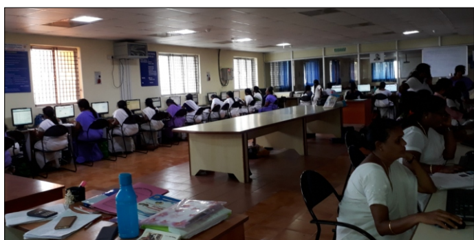
MLR orientation training for Village Health Nurses

As a part of the social responsibility, NSS Unit organized MLR Orientation Training for Village Health Nurses in association with the Department of public health and Preventive Medicine Health Unit (Chengalpattu) for two days on 30.11.2017 & 01.12.2017. This event was conducted for the online data entry work under Dr. Muthulakshmi Reddy Maternity benefits for the ladies. 133 Village Health Nurses participated from various rural and urban health centers.