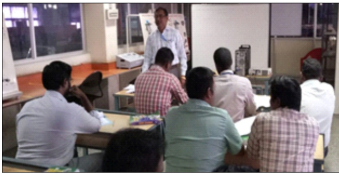
FDP on the 'Design of Transmission Systems'