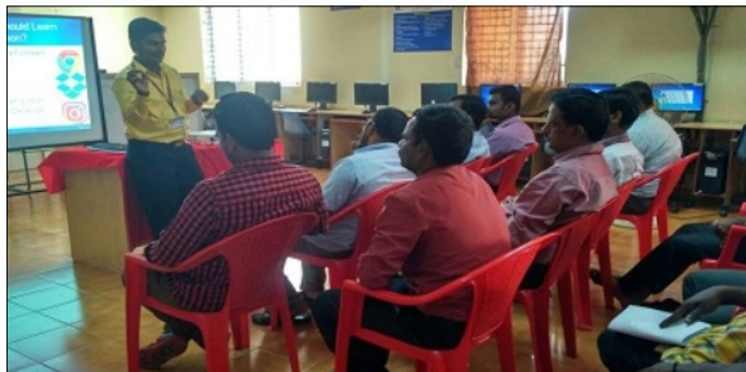
SDP on 'Python Programming' held on 09.11.2017

A one day Staff Development Programme for the supporting staff was organized on 'Python Programming' on 09 th November 2017.