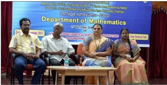
National Seminar on the Advances in Mathematical Sciences and Applications in Engineering & Technology