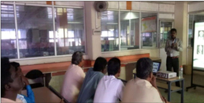
Hands-on training programme on the 'Thermo-Hydraulic Equipments'