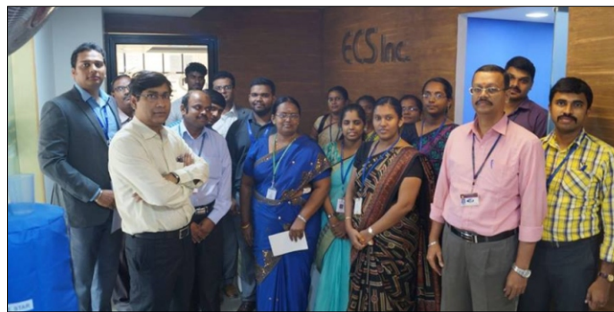
Industrial Visit to 'ECS Datamatics'

A one day Industrial Visit to 'ECS Datamatics' was organized on November 22nd 2017 for the Staff.