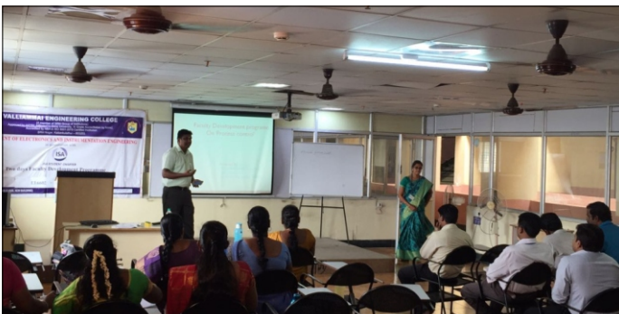
FDP on 'Process Control'

The Faculty Development Programme was held at Valliammai Engineering College on 'Discrete Time Systems and Signal Processing' on 07.11.17 & 08.11.17.