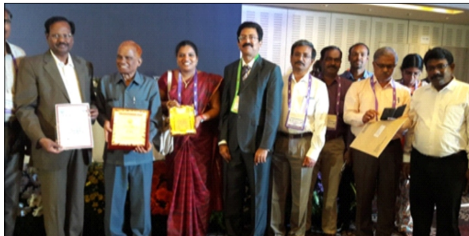
32 nd Indian Engineering Congress

43 students from second year, 139 students from third year and 81 students from final year attended In-plant Training in various organizations during their semester holidays.