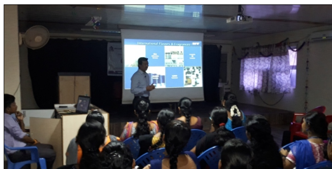
Lecture on the 'Role of Chemistry in Flavors Food Industry'