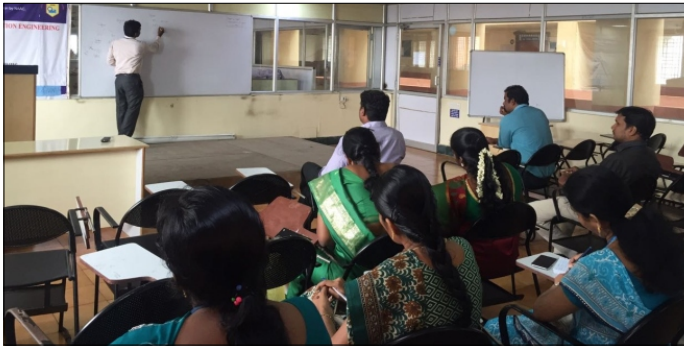
FDP on 'Discrete Time Systems and Signal Processing'

The Faculty Development Programme was held at Valliammai Engineering College on 'Discrete Time Systems and Signal Processing' on 07.11.17 & 08.11.17.