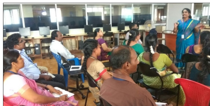
FDP on 'Knowledge Management'

A one day Faculty Development Programme on the 'Knowledge Management' was held on 15 th December 2017.