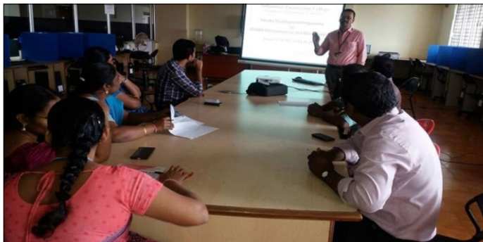
FDP on the 'Microprocessor and Microcontroller'

A two day FDP on the 'Microprocessor and Microcontroller' was organized on November 23 rd and 24 th 2017 for the staff members and our Dept Faculties were the Resource Persons.