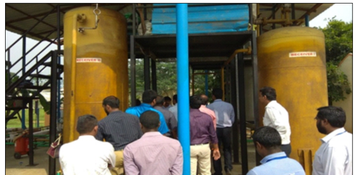
Industrial visit to 'CNG -Bio Plant' at Mahindra World City