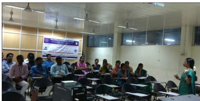
FDP on 'Object Oriented Programming'