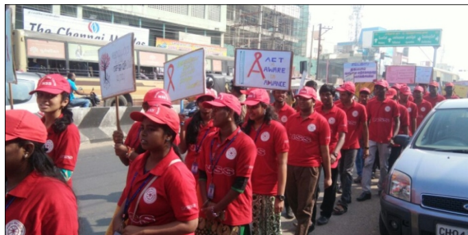
AIDS and HIV awareness rally

National Unity day (also known as Rashtriyav Ekta Diwas) is celebrated every year on the 31 st of October by the people all through India. It is celebrated to commemorate the birth anniversary of Sardar Vallabhbhai Patel who really unified the country. Rashtriyav Ekta Diwas or The National Unity Day was introduced by the Government of India in 2014 with the aim of celebrating this event every year on 31 st October. In memory of Rashtriyav Ekta Diwas, the NSS unit conducted a competition to design a t-shirt & cap to represent unification.