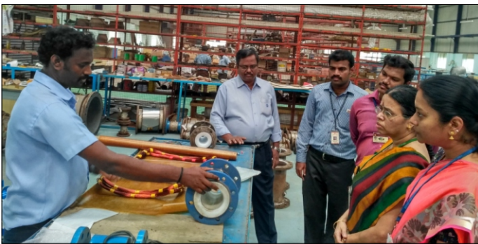
Industrial visit to RLT Instrumentation Pvt. Ltd., Chennai

An industrial visit to RLT Instrumentation Pvt. Ltd., Chennai was arranged for the Faculty members of the Dept. of Management Studies on 17.11.2017. The Staff had an opportunity to understand the nuances of the component manufacturing in sewage treatment systems and waste water recycling treatment.