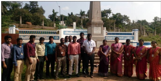
Faculty Industrial Visit to Poondi

The Faculty members of the Dept of Civil Engineering went on an Industrial Visit to the 'Institute of Hydraulics and Hydrology Poondi' on 16.11.2017.