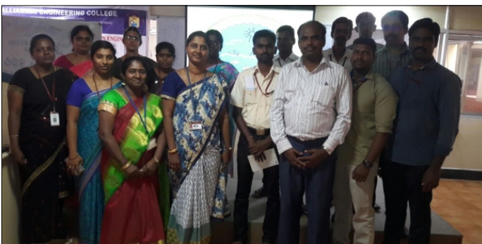
FDP on the 'Integrated Resource and Environmental Management'

The Faculty Development Programme was held at Valliammai Engineering College on 'Process Control' on 16.11.17 & 17.11.17.