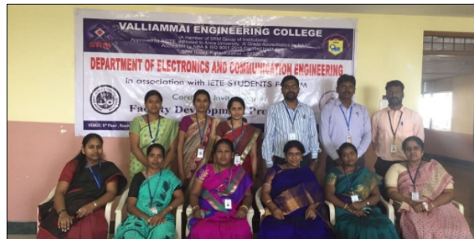
FDP on the 'Wireless Networks'