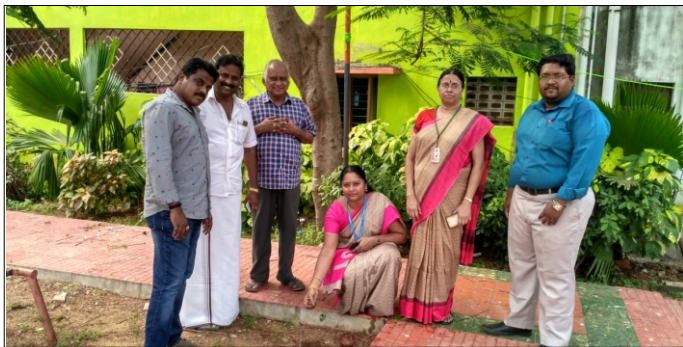
'Tree Sapling Plantation'

As part of Institutional Social Responsibility, 'Tree Sapling Plantation' activity was conducted by the Dept. of Management Studies in MGR Park, Periyar Park, and Anna Park Maraimalai Nagar on 24.11.2017.