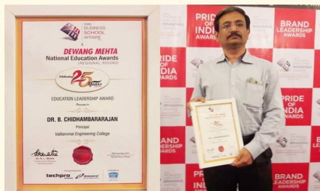
Dewang Mehta National Education Awards awarded ' Education Leadership Award' to our Principal on 12.12.2017 during the Academic Year 2017-18