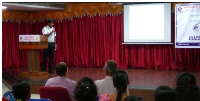
Guest Lecture on 'Nano Thin Films'