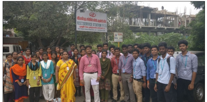
Industrial Visit to the VST Motors, Chennai

An industrial visit to the VST Motors, Chennai was arranged for the First Year MBA Students on 12.10.2017. The students had an opportunity to understand the dynamics of automobile dealership, Customer Relationship, Management and Salesmanship.