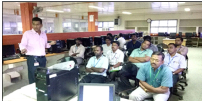
FDP on the 'Production planning and control'

A two day Faculty Development Programme on the 'Production planning and control' was conducted on 07.11.2017 and 08.11.2017 with a view to enriching the knowledge of production planning and control and their applications in industries. Dr.S.Thirugnanam and Mr.G.Anbuechzhayan delivered lectures on varied topics.